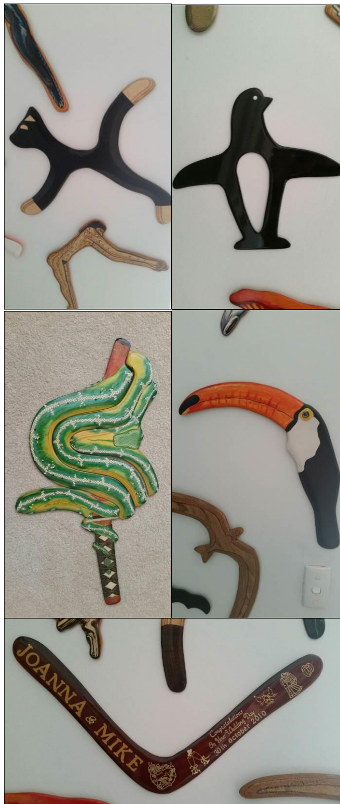
Mike Bryant's boomerang collection.

Opposite are examples of Mike's decorative boomerang collection.