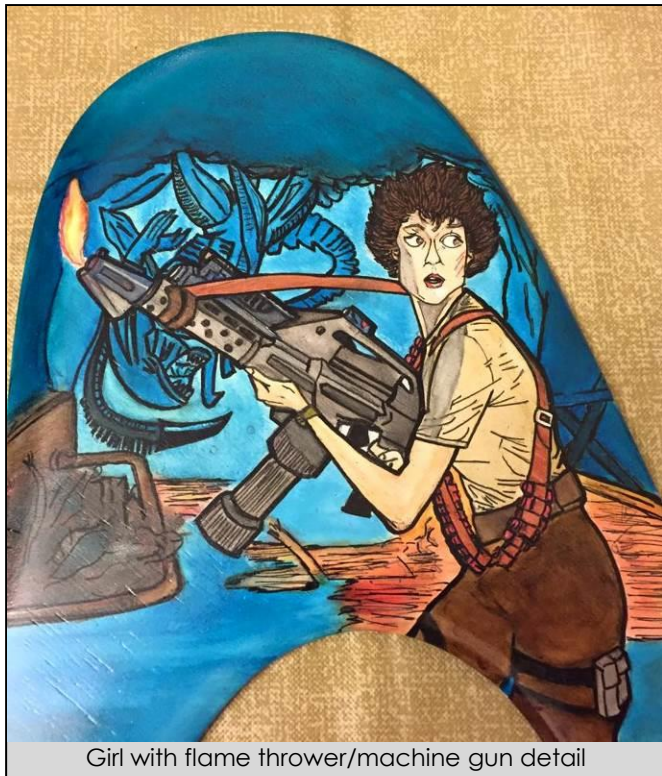
Girl with flame thrower/machine gun detail