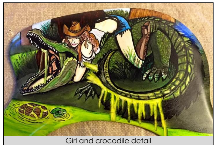
Girl and crocodile detail