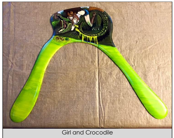
Girl and Crocodile