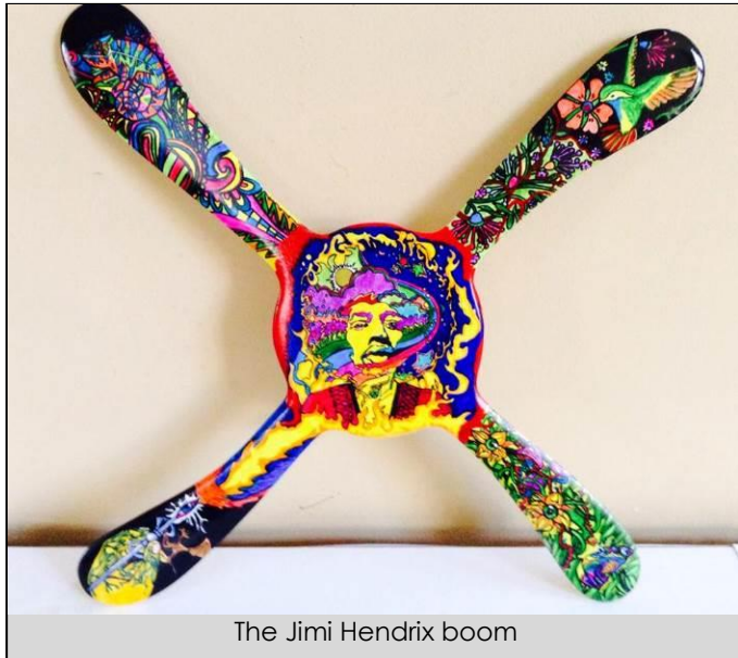
The Jimi Hendrix boom

Most: That I enjoy it. Least: Having someone tell me how they didn't follow instructions and they went out and broke all of my hard work into pieces.